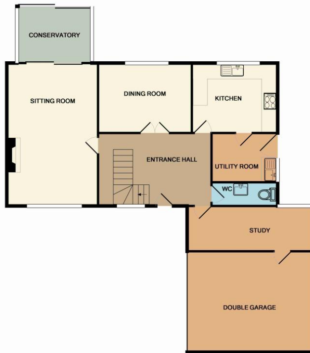
GROUND FLOOR APPROX. FLOOR AREA 111.6 SQ.M. (1201 SQ.FT.)