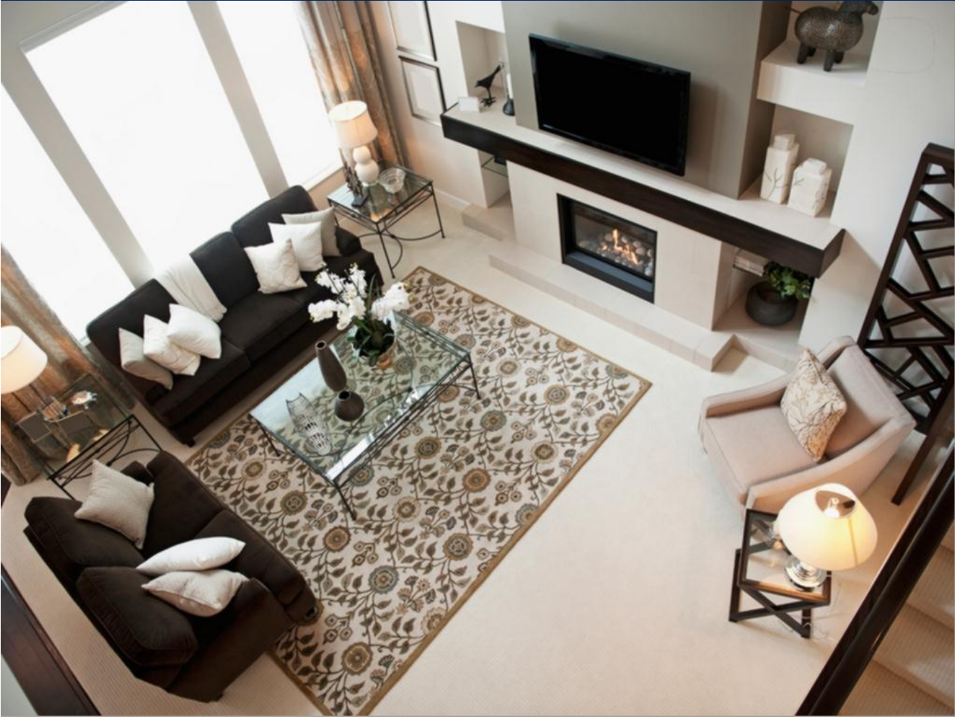
Terraced Home Lounge