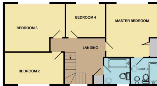
1ST FLOOR APPROX. FLOOR AREA 70.3 SQ.M. (757 SQ.FT.)

TOTAL APPROX. FLOOR AREA 181.9 SQ.M. (1958 SQ.FT.)